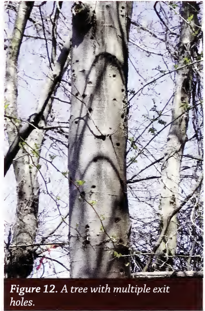
Figure 12. A tree with multiple exit holes.

also display dead or dying limbs, premature yellowing leaves, and canopy dieback.